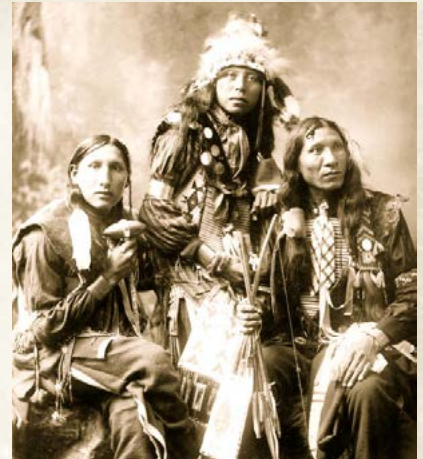
Three young Sioux Indian men, in the Black Hills, c. 1890.

The Tribal government operates under a constitution approved by the Tribal membership and Tribal Council of the Rosebud Sioux Tribe. The Tribal Council consists of a President, Vice-President, Secretary, Treasurer, a Sergeant-At-Arms, and twenty additional Council members that are elected by the Tribal members.