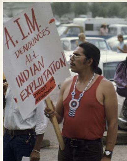
Circa 1970: An AIM (American Indian Movement) activist holds a placard protesting against Indian exploitation.

In 1973, “decades of discontent at the Pine Ridge Reservation resulted in a grassroots protest that escalated into the Wounded Knee Incident, gaining national attention.... supporters occupied the town in defiance of federal and state law enforcement in a protest that turned into an armed standoff lasting seventy-one days. This event inspired American Indians across the country and gradually led to changes at the reservation, with a revival of some cultural traditions,” (Oglala Nation Website). Several activists were killed and imprisoned during this period as a result of activist efforts.