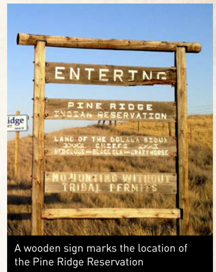
A wooden sign marks the location of the Pine Ridge Reservation

Pine Ridge is the site of many historically significant events. In 1800, the nomadic Lakota followed the buffalo across the midwest. In 1868, pioneering homesteaders arrived, resulting in immediate conflict. In November, Chief Red Cloud signed a treaty with the US Government, getting the land that now makes up the Pine Ridge Reservation. The environment, natural springs and fresh water and lumber made this area suitable for living. But then beginning in 1877, the government overruled the treaty, selling 7 million acres to the highest bidder. Battles erupted as the Lakota fought for their land. The government's repression of the Ghost Dances led to the Wounded Knee