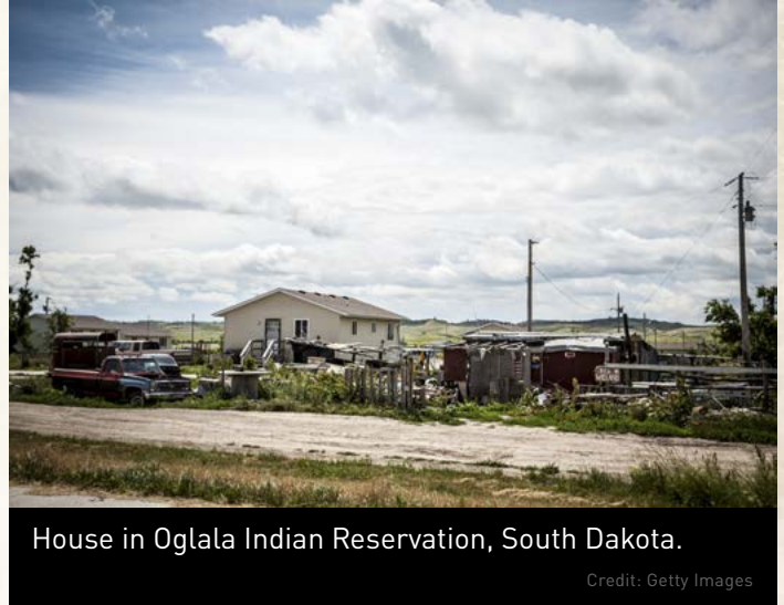
House in Oglala Indian Reservation, South Dakota.

Students identify things from the photos that surprise them or they are curious about (option 2).