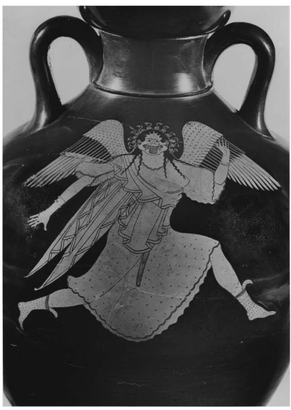
Figure 2: "Perseus and Medousa." Vase painting, attributed to the Berlin Painter. Ca 490 BCE Antikensammlungen, Munich, Germany.

becomes a woman's voice in a man's head, the hidden body between the neat and ordered, rational and cerebral, deeply inscribed lines of a masculinist history.