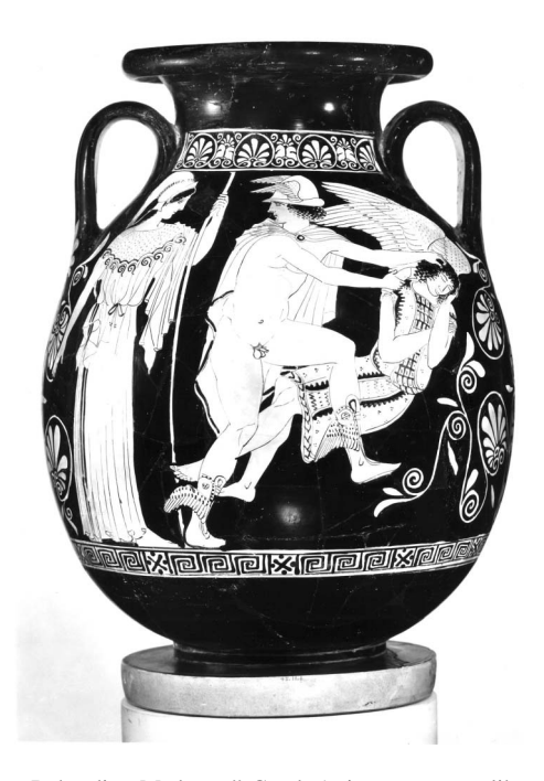
Figure 3: "Perseus Beheading Medousa." Greek Attic terracotta pelike, attributed to the Polygnotos painter. Ca 450 BCE. Metropolitan Museum of Art, New York City, USA.

Here, the message applies to her own work in interesting ways, as it applies to all of the stories in this essay. This can be a message to feminist rhetoricians and to all rhetorical historians. The body, alternately beautiful and monstrous, normal and abnormal, alive with significance and engorged and muted, gains power from this dynamism. What we need to flee from, following Medusa, are the appeals of certainty and sameness, whether rhetorical, historical, or corporeal.