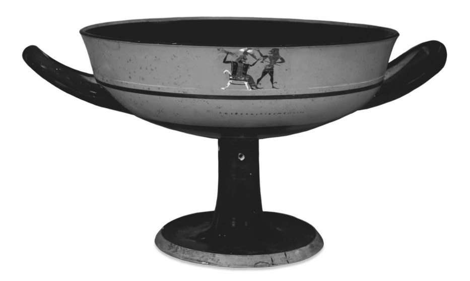
Figure 1: "Birth of Athena." Black-figured lip cup, attributed to the Phrynos Painter. 560–550 BCE. Trustees of the British Museum, London, England.