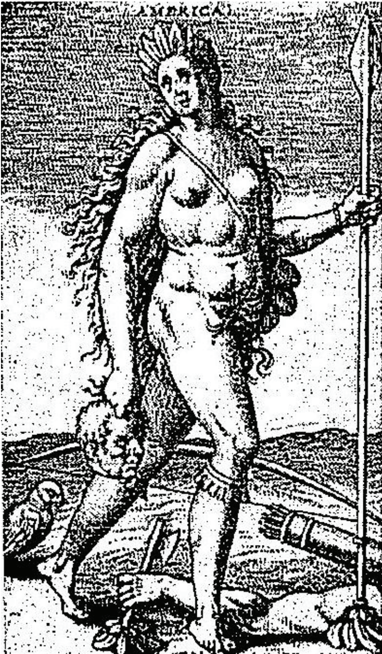
Figure 4: French engraving of Native American woman, 1579-1600.