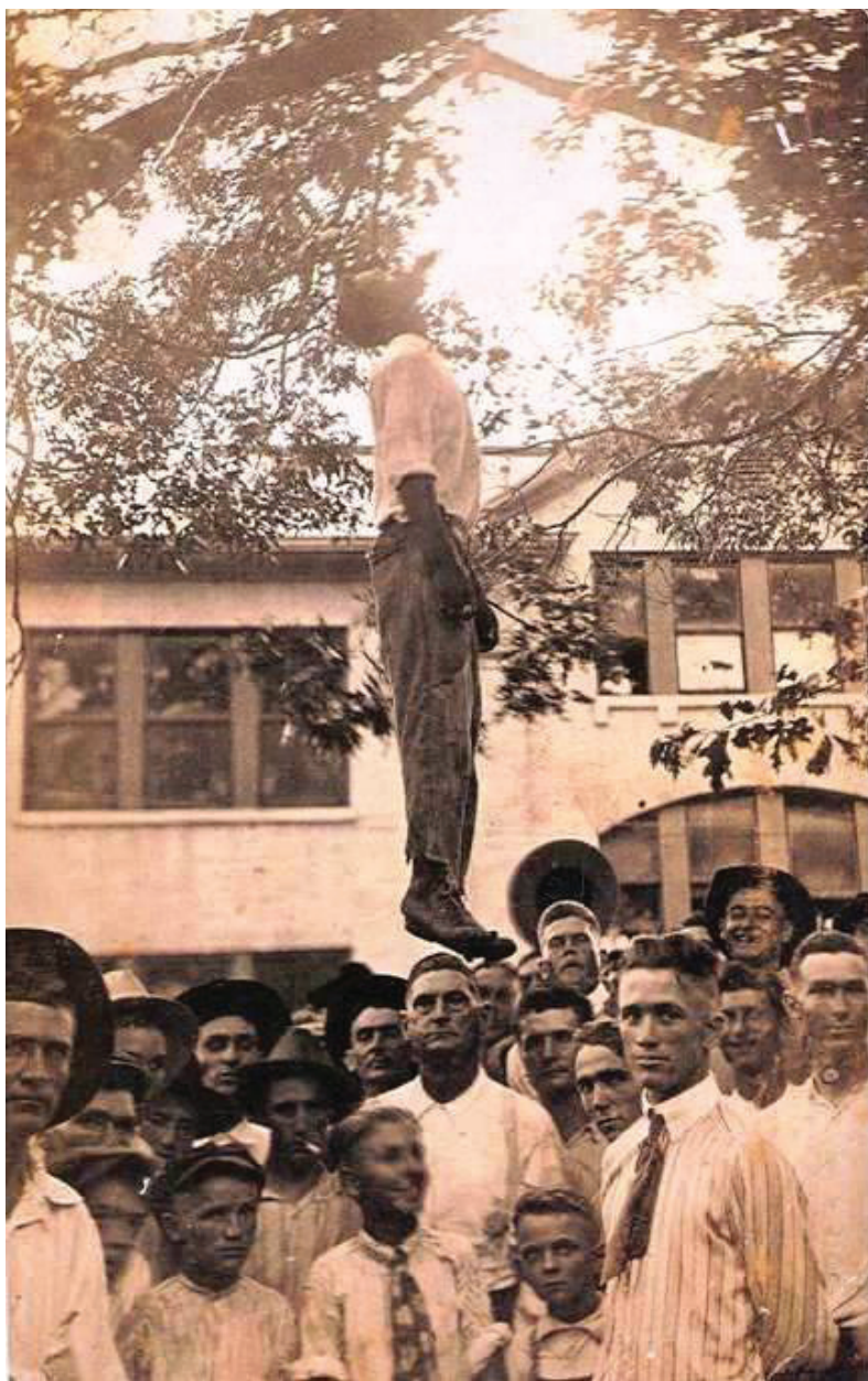
Figure 6: The lynching of Lige Daniels, August 3, 1920, Center, Texas. Gelatin silver print. Real photo postcard (front). 3 1/2" x 5 1/2".