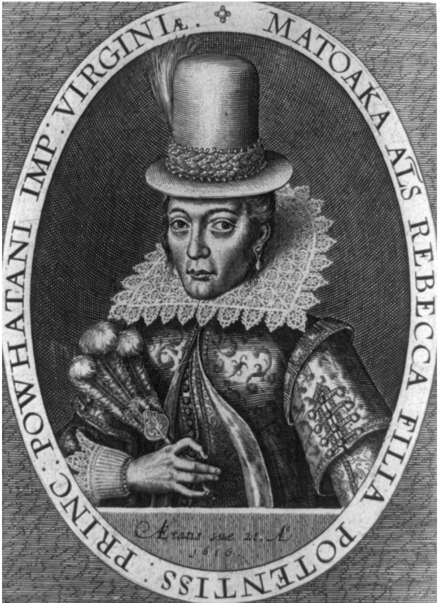
Figure 2: Pocahontas as depicted in Simon Van de Passe's 1616 engraving, Matoaka als Rebecca Filia Potentiss: Princ: Powhatani Imp: Virginia, from Camilla Townsend, Pocahontas and the Powhatan Dilemma (New York: Hill and Wang, 2004), 153.