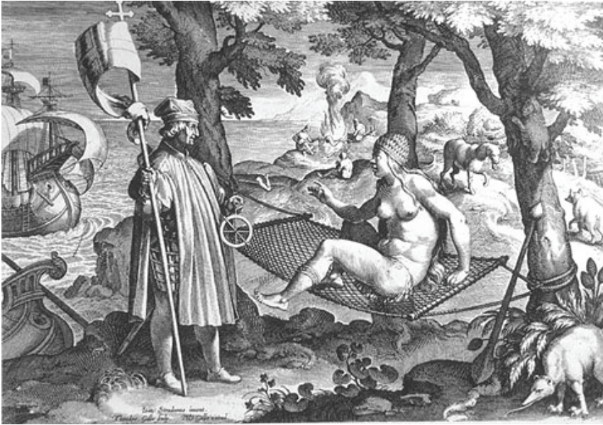
Figure 5: French engraving of Native American woman, 1575. 9

stature of “America”) has gone awry (Figure 4), or a seductive savage offering up her abundant landscape to the Christian master of “civilization” (Figure 5), manifold images of and messages about native women populated the imaginations of early European settlers in the Americas. Asking students to identify details and symbols within each image will nurture their visual acuity; guiding them through the meanings behind each detail and symbol will sharpen their critical thinking. Both tasks will enrich their understanding of the portraits of Pocahontas already discussed, and will lay useful groundwork for their analyses of other images throughout the course.