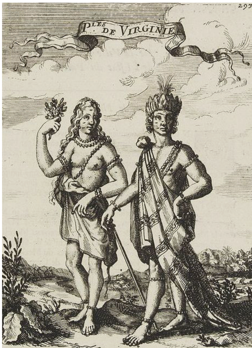
Figure 3: Alain Manesson Mallet's, P.les de Virginie, c. 1686. 8