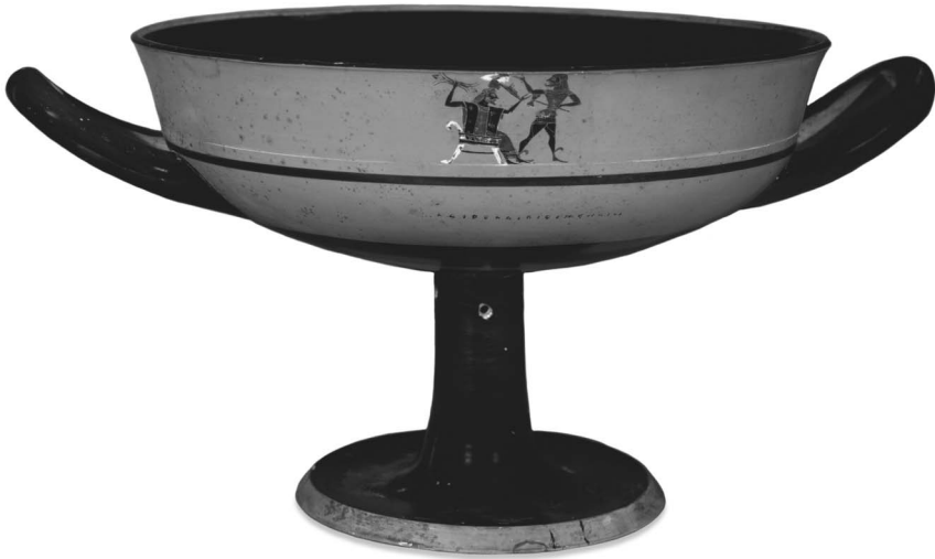
Figure 1: “Birth of Athena.” Black-figured lip cup, attributed to the Phrynos Painter. 560–550 BCE. Trustees of the British Museum, London, England.