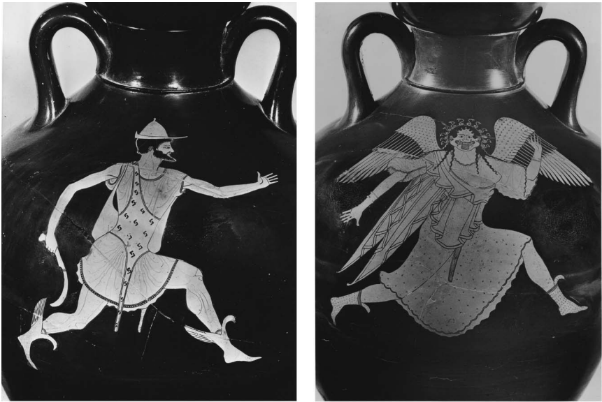
Figure 2: “Perseus and Medousa.” Vase painting, attributed to the Berlin Painter. Ca 490 BCE Antikensammlungen, Munich, Germany.

becomes a woman’s voice in a man’s head, the hidden body between the neat and ordered, rational and cerebral, deeply inscribed lines of a masculinist history.