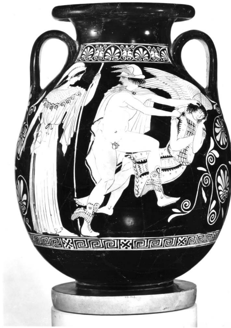
Figure 3: “Perseus Beheading Medousa.” Greek Attic terracotta pelike, attributed to the Polygnotos painter. Ca 450 BCE. Metropolitan Museum of Art, New York City, USA.

Here, the message applies to her own work in interesting ways, as it applies to all of the stories in this essay. This can be a message to feminist rhetoricians and to all rhetorical historians. The body, alternately beautiful and monstrous, normal and abnormal, alive with significance and engorged and muted, gains power from this dynamism. What we need to flee from, following Medusa, are the appeals of certainty and sameness, whether rhetorical, historical, or corporeal.